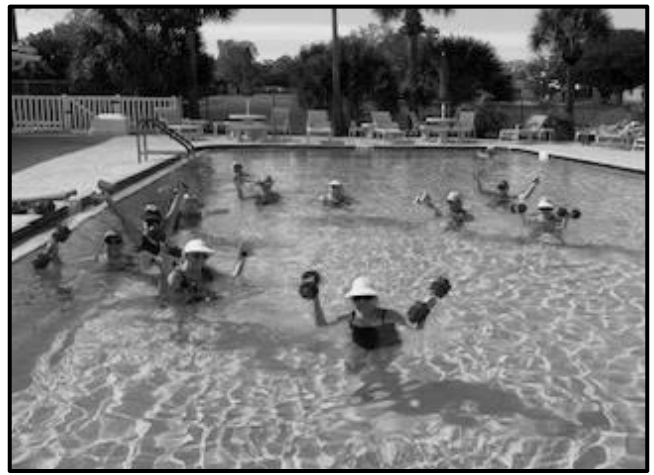
Aquatics Arthritis Fitness Class with Peggy!

Food will be distributed once all food items are on tables. You will be called in according to the number you received when you arrived.